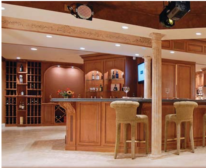
COMPLETE BASEMENT REMODELING AND CUSTOM WINE CELLARS

No matter the concern, trained, trustworthy professionals can set you straight. Maybe you don't have time to cook. Ease the burden by ordering groceries online and having them delivered to your home. If you